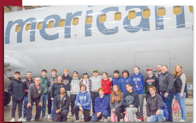
In March, students in Huntley High School's Project Lead the Way Aerospace Engineering course toured an American Airlines hangar at Chicago's O'Hare Airport.

Huntley 158 has remained steadfast in its commitment to Career and Technical Education (CTE) and saw remarkable growth during the 2022-23 school year. Interest in CTE programs continues to increase as we work to expand offerings to meet the needs of every student. With four academy programs and nine Illinois State Board of Education (ISBE) approved college and career pathways leading to one of five endorsements, students are equipped with a variety of opportunities for success.